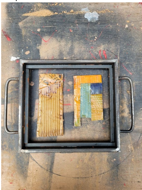
Sand casting process test using cardboard samples at CGLAS