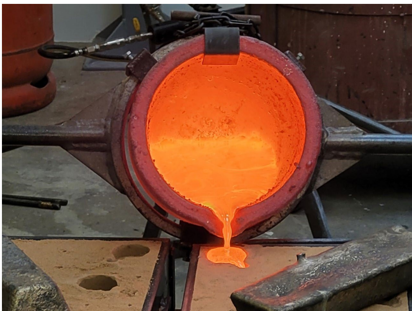
First Bronze pour using sand casting process- at CGLAS